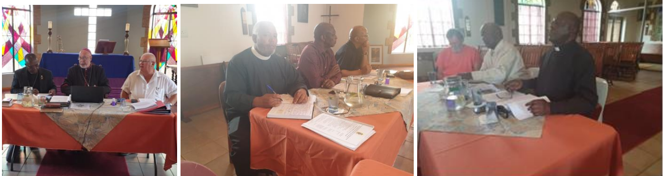
Member of the Diocesan Standing Committee hear the Principal's report on the Seminary.