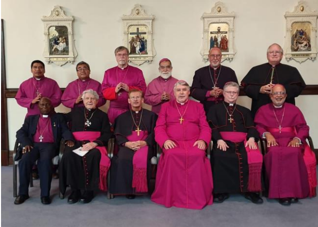
The College of Bishops TAC